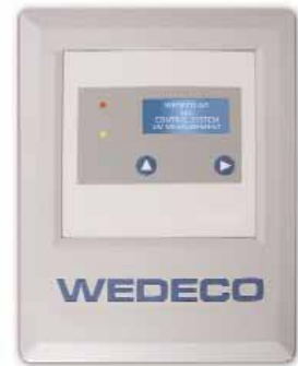
The new spectrum emission controller (SEC) handles all control and monitoring functions

All specifications are subject to change without notice.