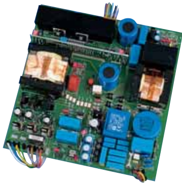
Electronic ballasts ensure that the Spektrotherm® HP UV lamps operate cost-effectively